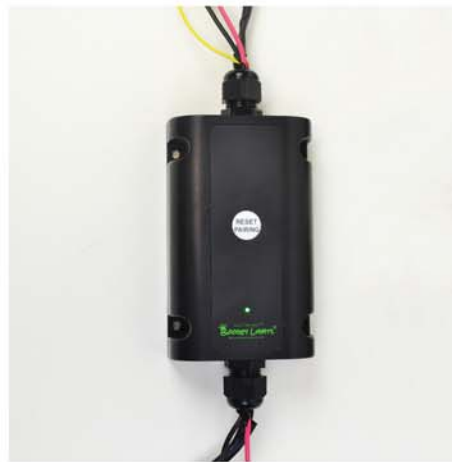
The green power light will flash when in pairing mode.

If you wish to pair a second Dual Zone M7 remote, repeat the pairing process.